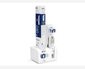
Optional Charging Station

Two cradles offer storage of probe cover boxes, and pop up for easy probe cover attachment. The large cradle can be wall mounted for added security when used with an optional security tether.