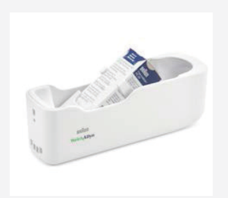
Small Cradle (one-box)